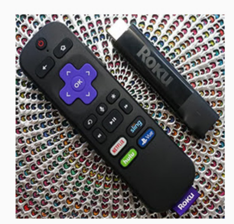
Best Streaming Device Of 2020: Roku, Apple Tv, Fire Stick, Nvidia Shield And More Compared